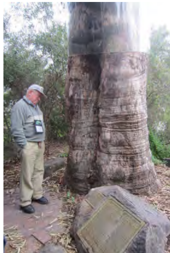
The Hovell Tree river red gum ( Eucalyptus camaldulensis )

Mr. Hume was the first to see the river, near the site of Albury and named it "the Hume," (now the Murray River) after his father. This place is called the 'Crossing Place' where Hovell carved his name into this tree on the 17 November 1824, before crossing into Victoria.