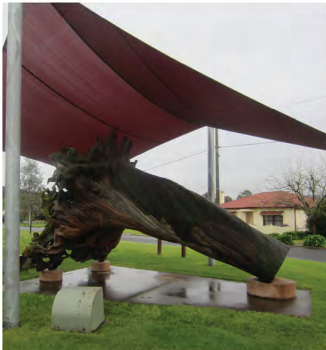
The Myrtleford Phoenix Tree.

The Myrtleford Phoenix Tree in the main street of Myrtleford is a huge river red gum ( Eucalyptus camaldulensis ) sculpture by Hanz Nohs, which represents the mythical Phoenix bird rising to life. As seen below it is covered to keep the sun off.