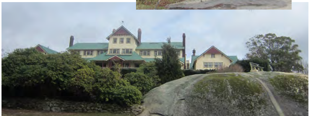
Mt Buffalo Chalet. Unfortunately now not in operation.