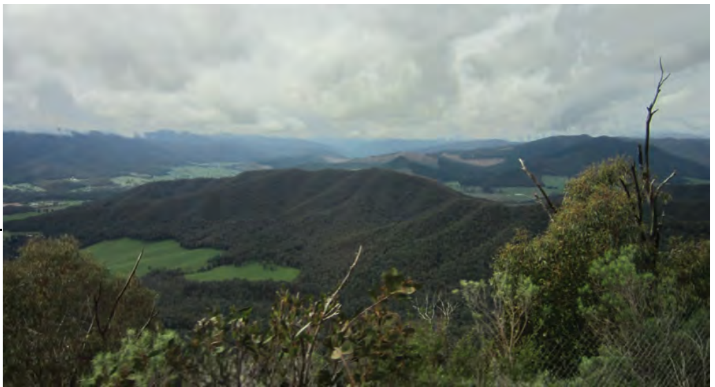
View from Mt Buffalo.

As we came up the mountain the change to granite was abrupt and there were sudden changes in tree species. We saw Eucalyptus dalrympleana (ribbon gum), and Eucalyptus mitchelliana (Mt Buffalo gum), which is found only on Mt Buffalo. We also saw Eucalyptus radiata (narrow-leaved peppermint), which following fire, will produce regrowth from the canopy, compared to others that will regrow from epicormic tissue in the stem, or from tillers, as in Mt Buffalo gum.