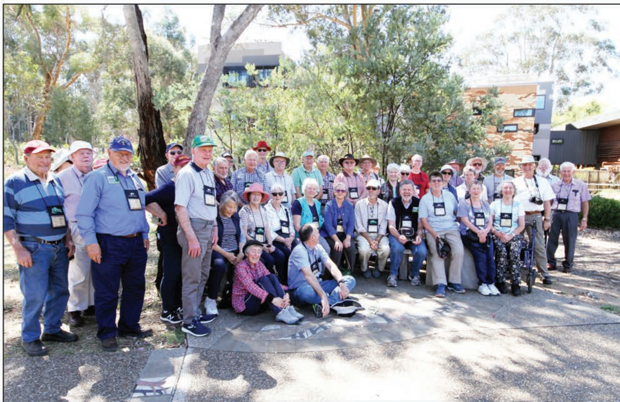
A group shot taken while we walked through the Lindsay Pryor Walk in the grounds of the Australian National University during our visit there (See Xylarium photo on the next page!)