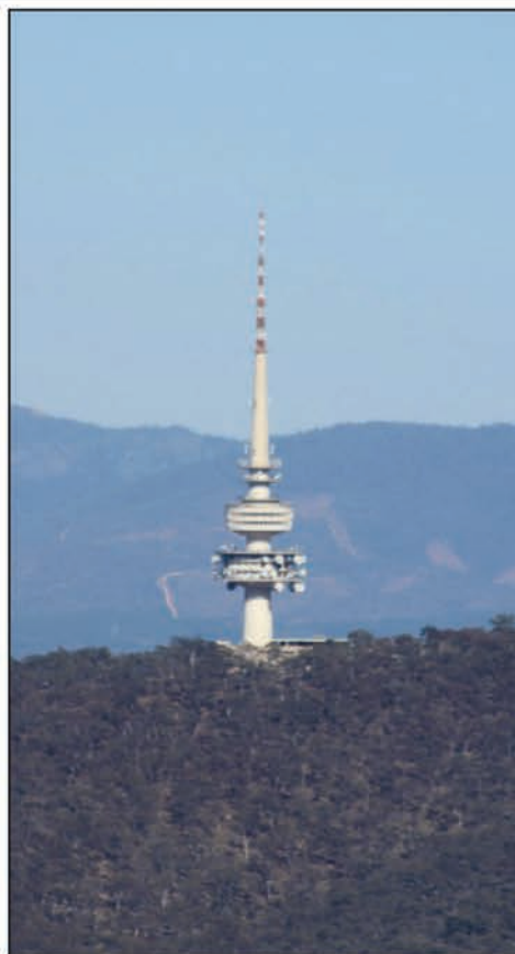
Looking up to Black Mountain Telstra Tower

The list therefore represents a broad range of Australia's most ancient species, and indeed is a representation of the world's most ancient species — which I feel is highly significant — and can be woven into a magnificent story, placing the continent of Australia high on the world's most significant tree species still surviving. Eugene expressed the hope that members from each state will now make displays of their state selections in the form of wood samples, turned or carved items, seed pods and posters, as a way to attract media interest for continuing the project. The next phase of the project will be the selection of a National Tree.