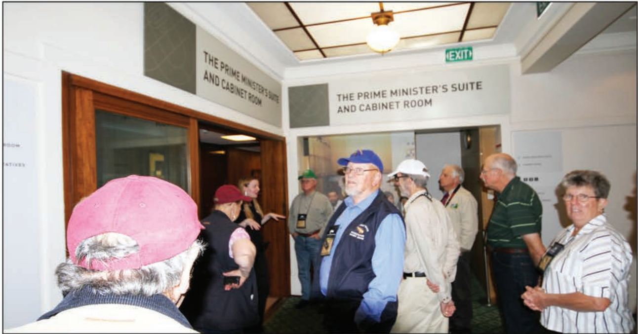
We are about to be shown through the Prime Minister's Suite and Cabinet Room.