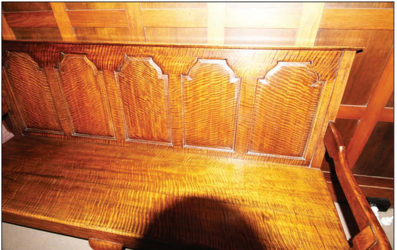
The wall panels are of Acacia melanoxylon (blackwood) and the seat is of highly figured Endiandra palmerstonii (Queensland walnut) — a very rare find today.