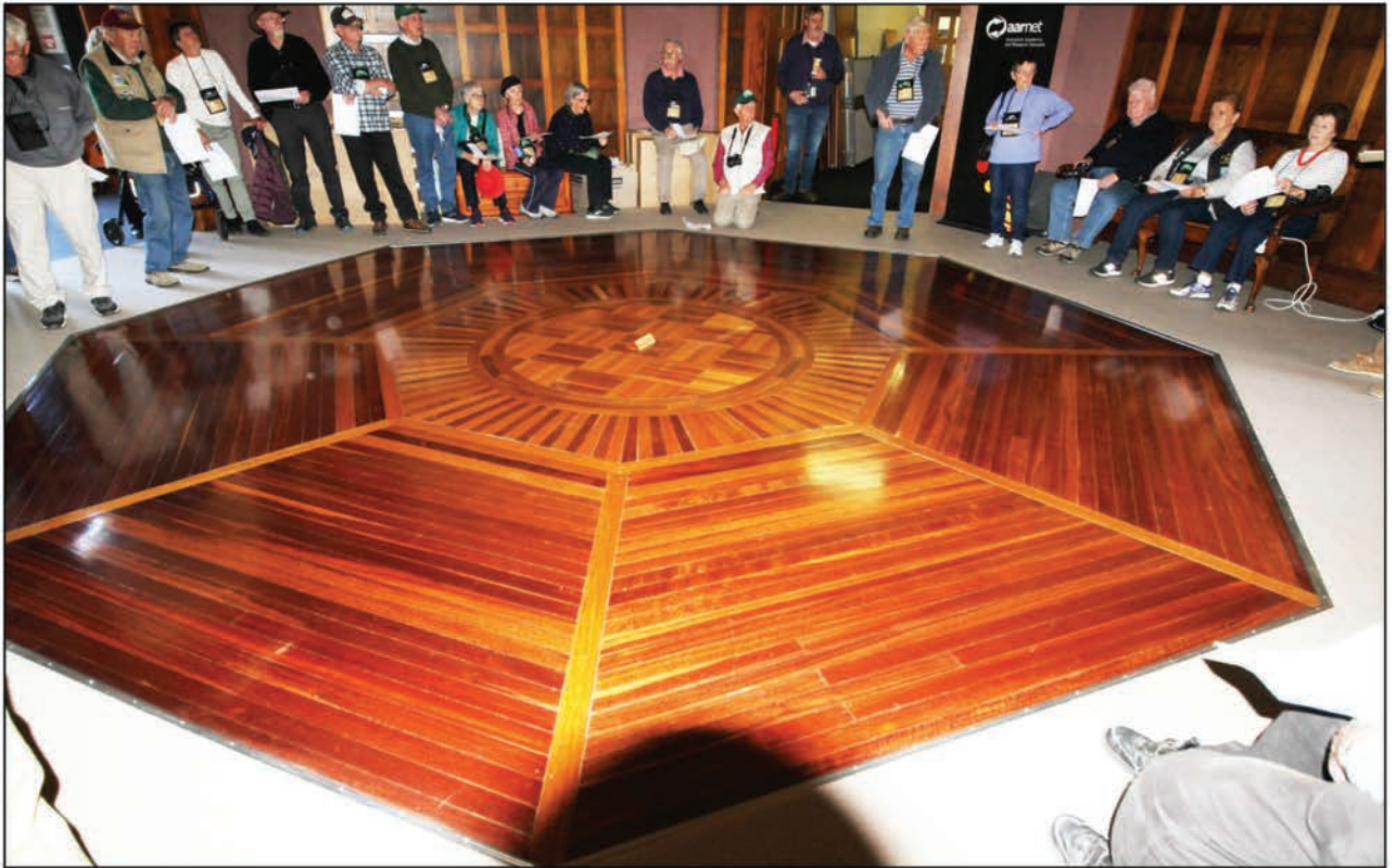
Members gathered around the Hall floor which is made from Acacia melanoxylon (blackwood), jarrah ( Eucalyptus marginata ), tallow wood ( Eucalyptus microcorys ), and mountain ash ( Eucalyptus regnans ).