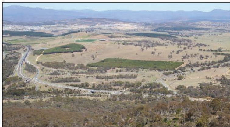
A view of the National Arboretum showing Griffin's rectangular cork oak plantation ( Quercus suber ) in the middle and his Himalayan cedars ( Cedrus deodora ) the triangular plantation to the left