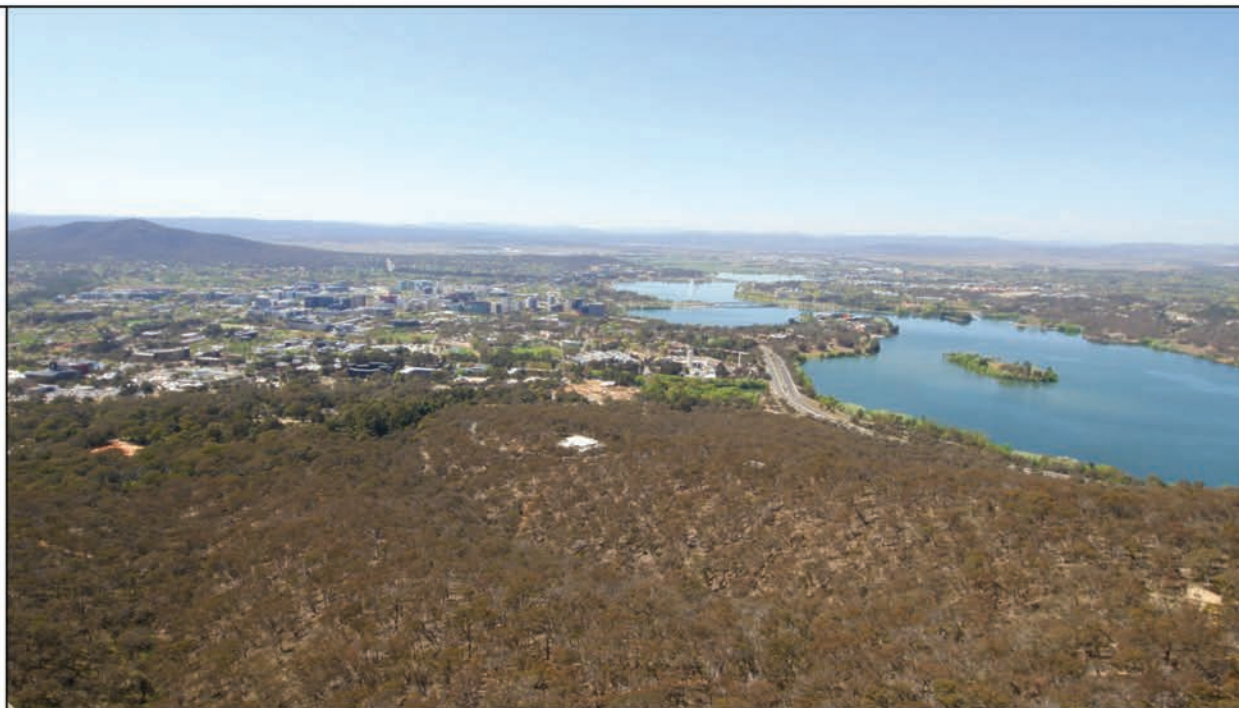
Looking across from Telstra Tower to the city area of Canberra

We then proceeded to the Black Mountain Tower for morning tea, and from where we were able to view across at the vast area used in tree planting trials, which were established in the early years of forestry research. These trials were specifically for species which could be used in the future for the production of millable building timber and included mostly pine species. From the Telstra Tower we met up with Duncan MacLennan, Urban Tree Manager at the National Capital Authority, for a tour of the Lindsay Prior Memorial, a trial area of 610 ha (~1507 acres), containing 18,000 trees in total and 2,000 trees in the Arboretum. The Arboretum was started in 1954 and planting was completed in the 1960s. The purpose was to test trees for use in the city streets and parks, and none were irrigated.