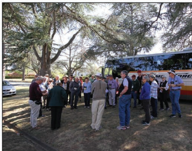
Members attentive to Sam's talk. Note the tree-lined verge is between the main bitumen and the footpath and gutter.

On our way to Black Mountain, we met up with Sam Ning, Tree Protection Officer, ACT Government, to hear about aspects of street tree planting in Canberra. The most obvious feature being the extensive planting of street trees — and there are now 760,000 trees in the city, all of which are on a Tree Register and each has a legislated 5 m protection zone around it. All trimmings and cut trees are mulched, and approval is needed to remove a tree if it is still alive. Street plantings are generally a single species planting and over the years, 80-90 species have been planted and generally between 800 and 1,000 trees are planted each year. It is planned to increase this number by 20-30% in the future. The vast majority of the plantings are not Australian species.